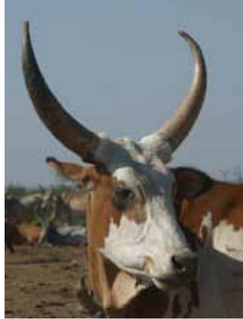
Afar cattle, Ethiopia

produce relatively high volumes of milk but also need more water and therefore dry up relatively quickly during the dry season.