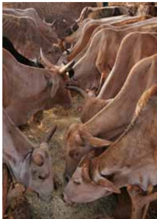
Supplementary feeding of cattle during drought in Borana areas, southern Ethiopia

2008 SCUS implemented a supplementary feeding project in Borana based on 10 feeding centers with 6,750 cattle (Bekele and Tsehay, 2008).