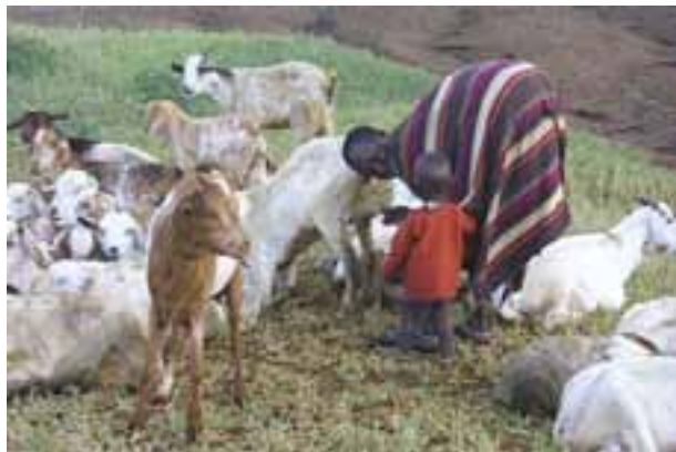
Milking Maasai goats, Tanzania

producing milk. The use of yaks in Tibet is an example of this strategy, but here again, mixed herds are used comprising yaks and sheep (Nori 2004). In Afghanistan, Kuchi pastoralists rear mixed herds of cattle, sheep and goats, with some also keeping camels and donkeys for transport (Fitzherbert 2007).