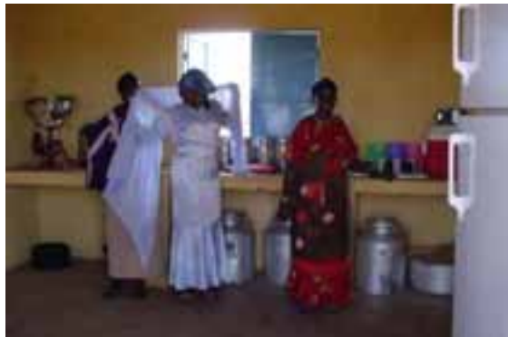
The Loglogo women's dairy in northern Kenya

In northern Kenya, an OFDA-funded project implemented by Tufts University and AU/IBAR supported women's groups to set up small dairies for processing and sale of milk. The intervention was assessed in terms of the viability of the dairies as small businesses and recent development includes the commercial sale of camel milk for packaging and supply to local supermarkets and for export (Odhiambo 2006).