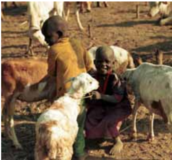
Sheep in South Sudan

Goats are particularly drought-resistant and can continue to supply some milk for human consumption throughout a dry season. They multiply faster than large livestock and produce more milk through a longer lactation period than that of sheep (Degen 2007). Cattle