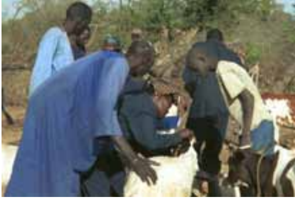
Community-based animal health workers in South Sudan

During the last 10 years or so, various NGOs have assessed the impact of CAHW projects in pastoralist areas using participatory impact