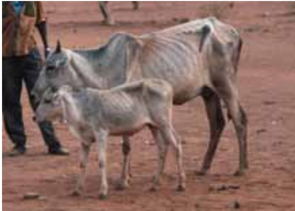
Trypanosomiasis causing emaciation and reduced milk production in cattle, Somali region of Ethiopia