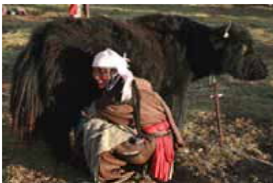
Milking a yak on the Tibet-Qinghai plateau