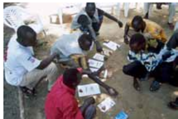
Research in South Sudan on the livelihoods and nutritional impact of foot-and-mouth disease

Using participatory methods in South Sudan, Nuer herders estimated milk losses in cattle due to acute foot-and-mouth disease at 1.6 liters per day (95% CI 1.20, 1.95 liters per day) for an average of 14 days; this represented a 62% fall in production in affected cows during the period of clinical disease (Barasa, Catley et al. 2008). By combining this information with estimates of disease incidence by age group, the reduced volume of milk available for human consumption due to foot-and-mouth disease (FMD) was estimated at 839 liters per household. Assuming intake of no other foods,