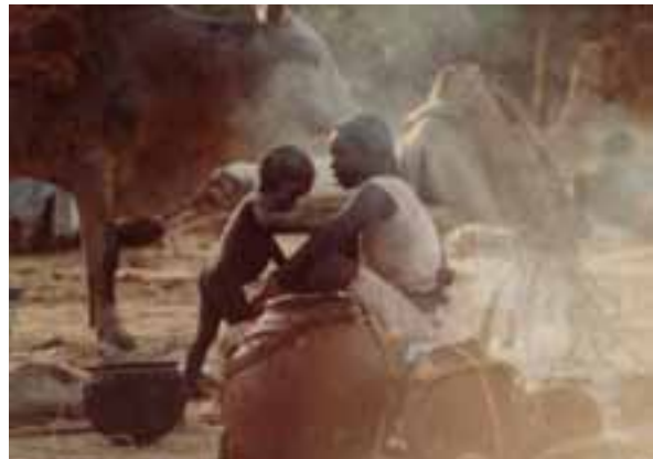
Baggara Arab nomad with milk containers, Darfur

Daniel Sellen's longitudinal studies on the Datoga found that supplementary foods fed to infants and young children included fresh and soured goat or cow's milk, maize-meal gruel and the principal adult staple, stiff maize-meal porridge; that the median ages of introduction of non-human milks, introduction of grain-based solids, and cessation of breast-feeding were 2, 11 and 20 months respectively; and that feeding practices show a lack of concordance with international standards.