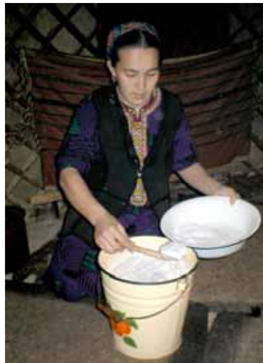
Nomadic woman making charl (soured camel milk), Turkmenistan

Processing milk into hard cheese also increases the energy and fat soluble vitamin density of the product by, roughly, a factor of between 5 and 9 (U.S. Department of Agriculture and Agricultural Research Service 2008). Unlike the transformation into milk-fat, transforming milk into hard cheese also increases the density of protein and minerals such as calcium (U.S. Department of Agriculture and Agricultural Research Service 2008). Both soft cheese (of the type often produced from milk in the developing world) and yogurt maintain a very similar nutrient profile to milk (Platt 1962; U.S. Department of Agriculture and Agricultural Research Service 2008).